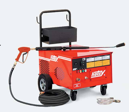
Model 1720 shown with optional wheel kit